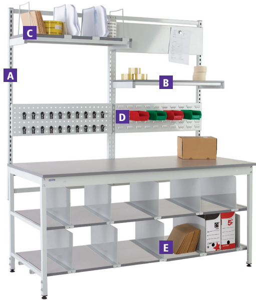
Pack Tek Individual Kit 2 - Dimensions/Codes