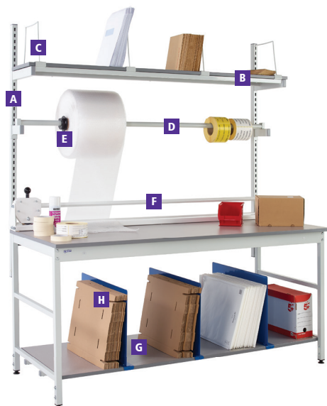
Pack Tek Individual Kit 3 - Dimensions/Codes